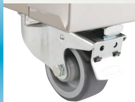
all models are supplied with castors as standard