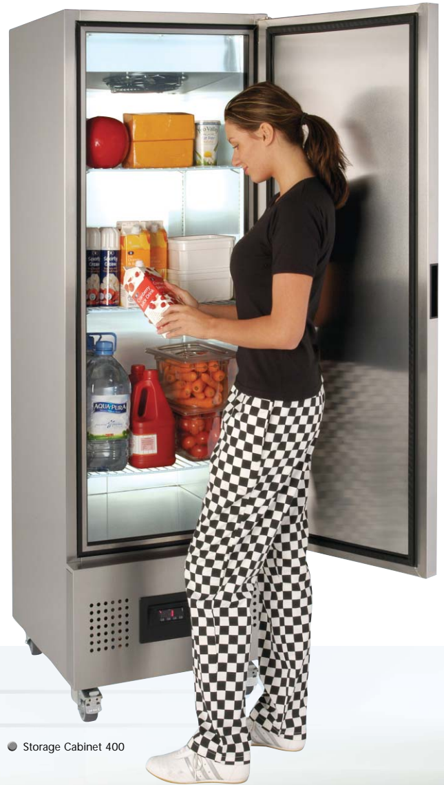
● Storage Cabinet 400