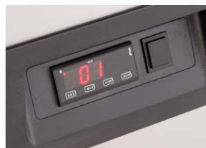
simple to operate microprocessor control on all models