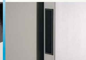
easy grip door handle