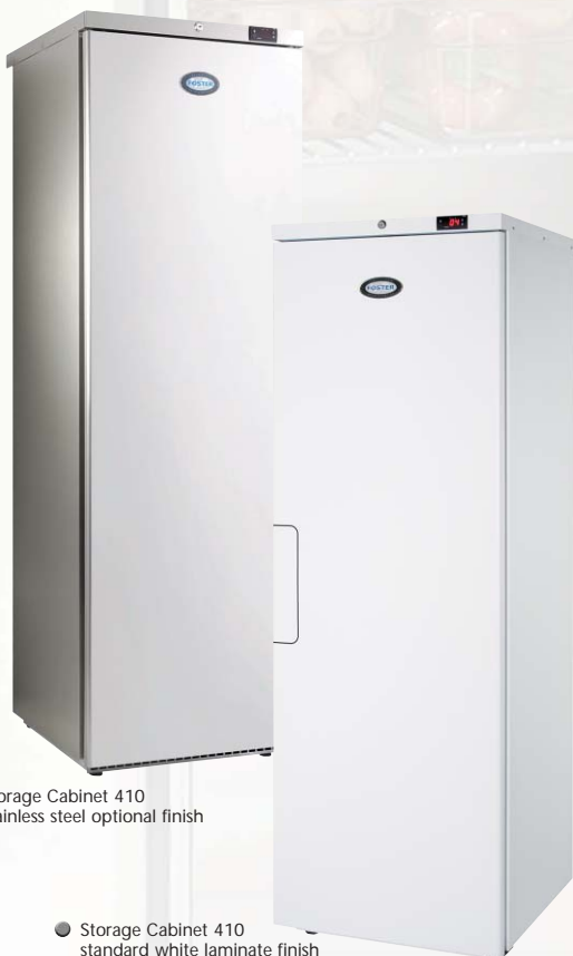
● Storage Cabinet 410 stainless steel optional finish