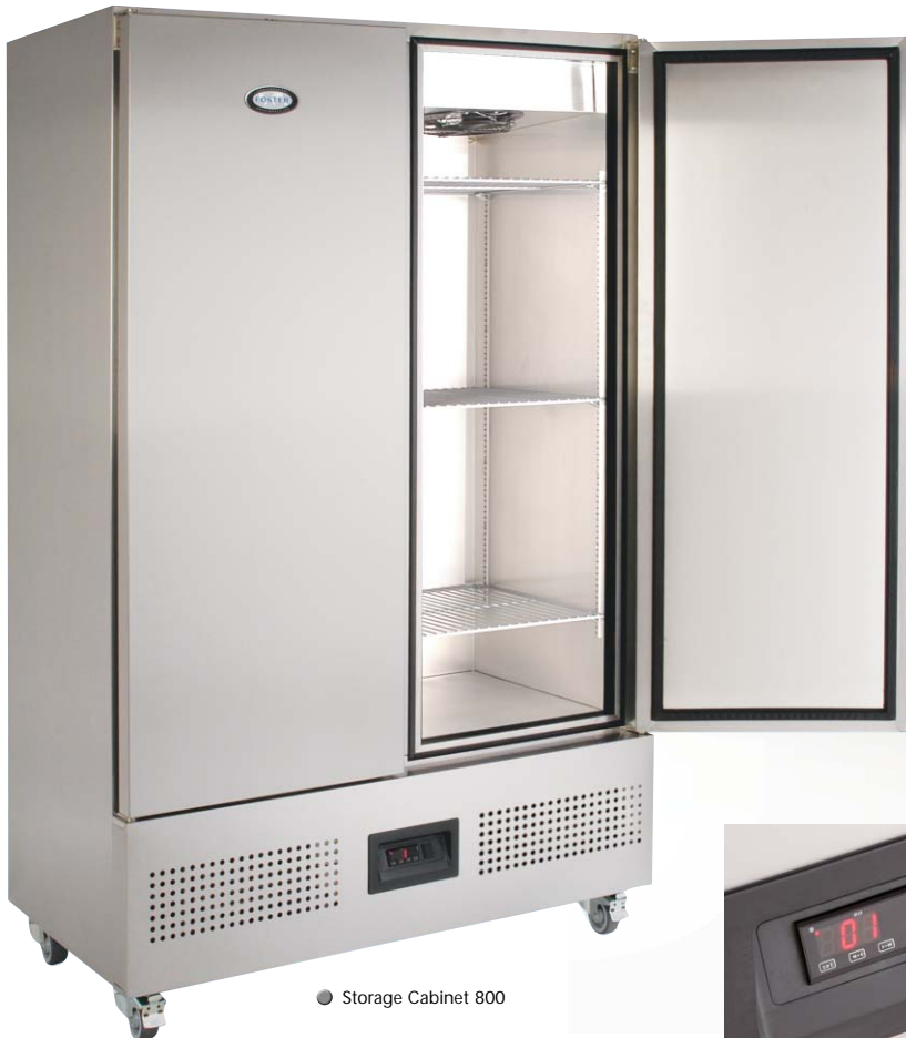
● Storage Cabinet 800