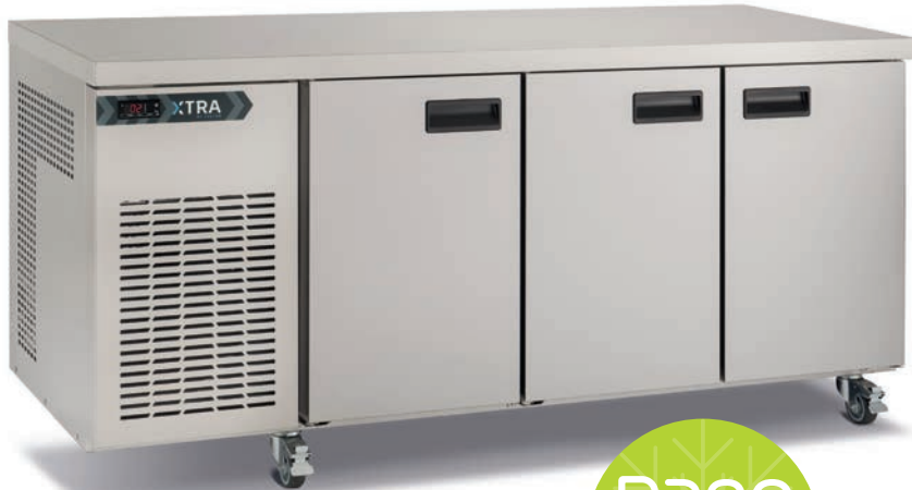
XR3H refrigerated counter