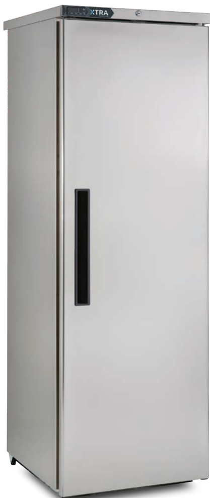
XR415H 400 litre capacity cabinet