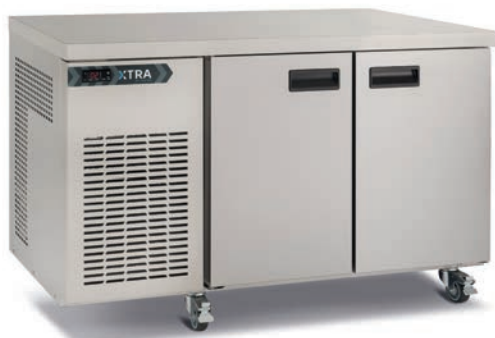
XR2H refrigerated counter