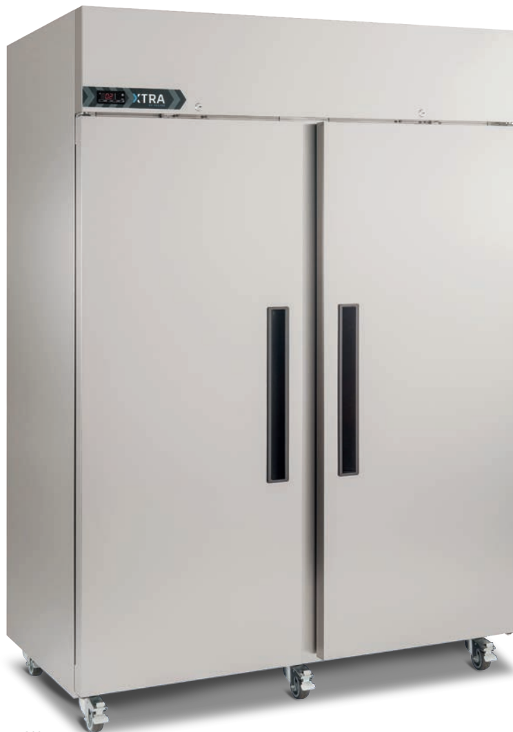
XR1300H 1300 litre capacity cabinet