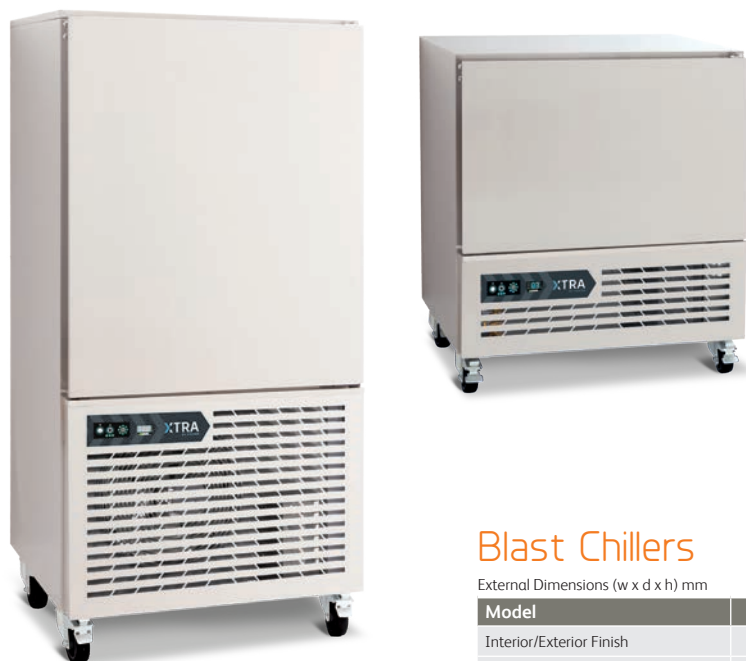
(Right to left): XR35 & XR10/20 Blast Chillers