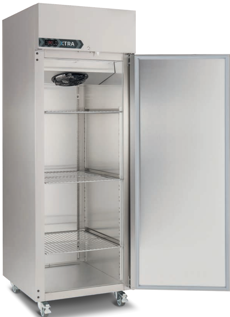
XR600H 600 litre capacity cabinet